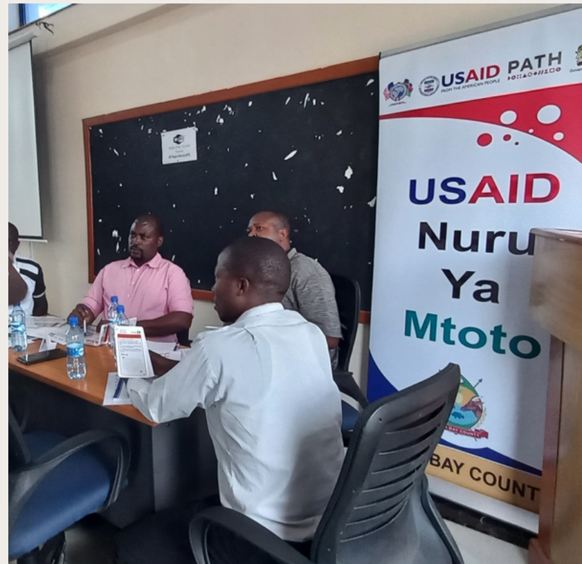
Training of Coaches