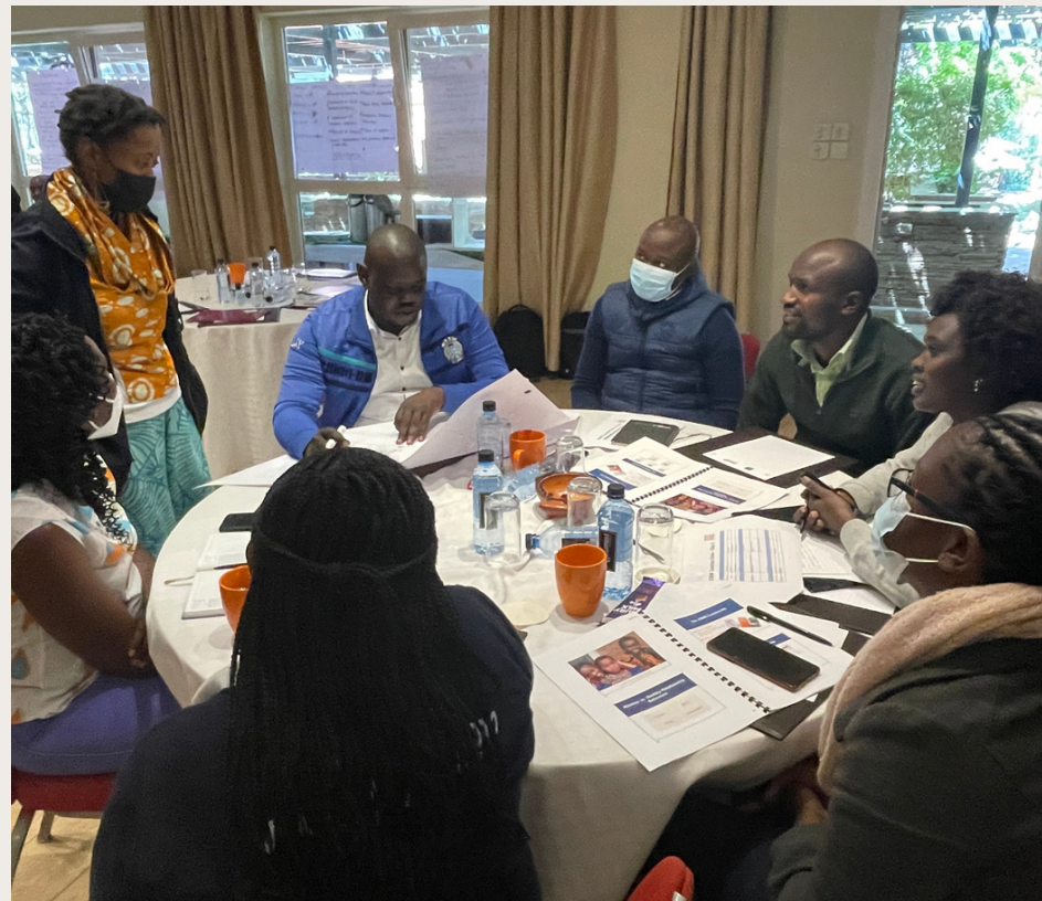
Training of Coaches Clinic Facilitators