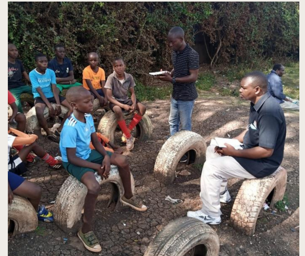
Delivering CBIM to Athletes